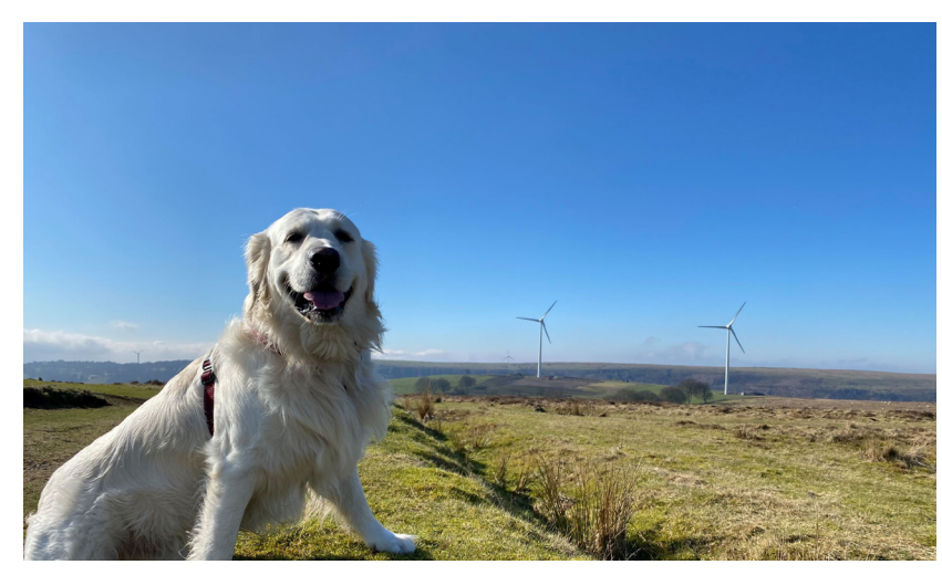
Cover Photo: "Wind Power", Manmoel Common.